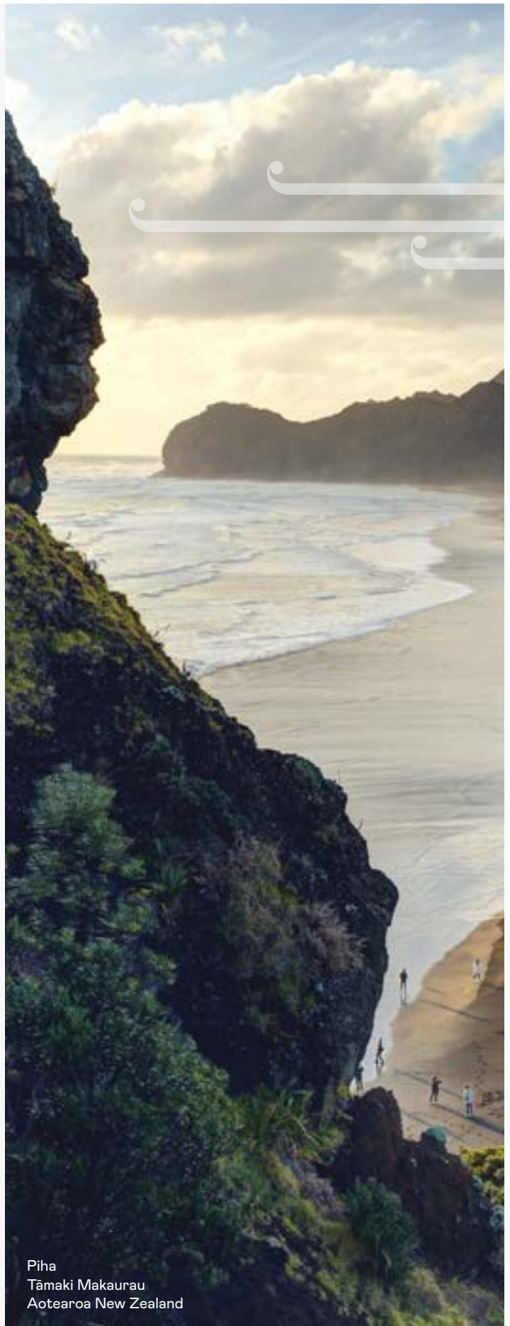
Piha Tāmaki Makaurau Aotearoa New Zealand

*Fidelity Life has an A- (Excellent) financial strength rating from A.M. Best. The rating scale that this rating forms part of is available for inspection at our offices. For more information please visit Fidelity Life's financial strength page .